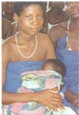
A young slave girl with her child, born through rape while in slavery, on the day of their liberation

It is estimated there were about 5,000 trokosi held in shrines in Ghana when Christians began to get involved in the 1980's. On an average each trokosi slave ends up having an average of four children each as a result of being regularly raped by the priest. Although they are not technically considered trokosi, they also serve every whim of the priest without pay so they are in reality slaves as well. Considering this, the system involved about 25,000 lives in Ghana. The number of trokosi in Togo and Benin has never been counted, but we know there are a substantial number.