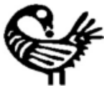
Symbol of the Sankofa "Back to our Roots" movement.

The exact amount varies and cannot be predicted in advance. Because we need to have funding in hand to even begin negotiations, we have estimated the cost based on past experience. It costs about $200 to free one trokosi and help her start a new life. All her children go free with her, so it ends up costing about $40 per person when we consider the children as well. Additional expenses may be incurred in offering vocational training to the girls. So depending on the size of the group, your goal may be $40 for one child to $200 for one "family" or more. Of course, donations in any amount always help and are deeply appreciated. Over and over as we have interviewed young women who have been victimized by the practice of trokosi, they have pleaded with us to do all we can to help liberate other girls still held in the shrines against their will. Their lives are being destroyed. They have suffered too long. Your help can make the difference that can set them on the road to healing, restoration, and a normal, productive life. Please help in any way you can!