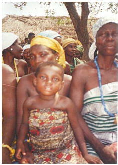
A child born into trokosi slavery sits on her mother's lap as they were both liberated from slavery through the gifts & prayers of ECM partners. Freed on Jan. 31, 2003

Evil dies hard. Unfortunately slavery exists in many parts of the world today. One of the most active places in the world for child slavery is West Africa. There are several kinds of slavery. Some of it is based on exploiting children for free labor in order to make products cheap and profitable. Some of it is based on exploiting children for the sex and pornography markets. Some of it is based on cultural traditions involving the requirement of a young girl in payment for the services of the priests in shrines of African traditional religion. These girls are called "trokosi," (Ewe spelling troxovi) and it is securing their freedom that Every Child Ministries has undertaken as its first project in fighting child slavery.