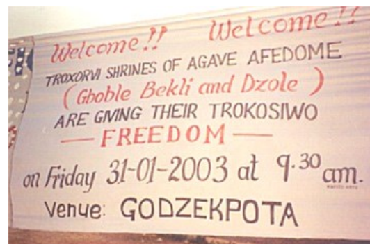
A banner publicly advertises the first slave liberation funded by Every Child Ministries. These things are not done in secret.

The question we have to ask is, do the people of the Afrikania Mission value their traditional ways of life more than they value the freedom and the lives of the girls who are held in bondage? Have they not chosen their idols rather than the true and living God? Are they not slaves of a different kind? These people also need our prayers. Recently we have seen, however, that sometimes when those who oppose us receive more information, they do see things more clearly and even come over to help free the girls whose liberation they once opposed. So keep these people in your prayers. God loves them too, and would offer them freedom as well.