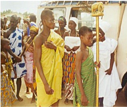
A standard bearer carries the clan emblem as a chief and elders arrive at a liberation ceremony, January 31, 2003.

In cases where freedom is negotiated, a small payment is made to the priest for each girl. Although he is free to use the money as he pleases, some have said they would buy corn mills with which they make money, since in freeing the slaves the priest loses a way of making a profit. Freedom money is also used to share the Gospel in a deep, personal way with priests. Some choose Christ and desire to free their slaves. Some of the money is used to facilitate the negotiations which result eventually in the release of slaves and the ending of slavery in a given area. Some of the money is used for counseling to help prepare the girls for a life of freedom that some of them have never known. Other money is used for the liberation ceremony in which the girls are given their freedom. This is a public ceremony which facilitates the re-entry of the girls into the wider community. Finally, some of the money is used to help the girls start new lives after release.